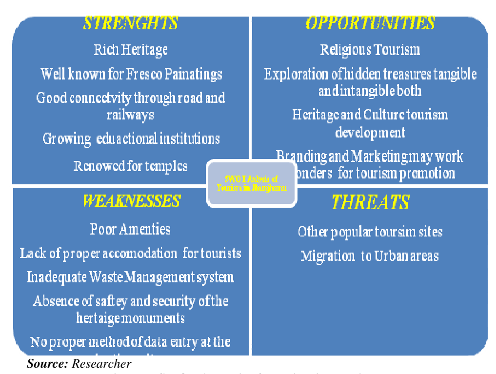
Figure I: SWOT Analysis of Tourism in Jhunjhunu

thus got added to Shekhawati [3]. The diverse heritage havelis (mansions) of Jhunjhunu that were built by the Marwari merchants, magnificent stepwells, kua, chattris (cenotaphs), forts and temples are define the legacy of the destination. Major role was played by the merchants and rich people who transformed the desert land into a knowledge providing source through the fresco paintings on the walls of their havelis. This knowledge and art combination at the capital of Shekhawati attracts tourists not only from the purpose of visiting to admire the beautiful paintings and havelis but also to know about the past of the region. The physical artifacts are awesome. The monuments like Khetri Mahal, Cenotaph of Sardul Singh, Rani Sati temple, Mertaniji ki Baori (stepwell), Birdi Chand well, Badalgarh fort, Ajit sagar, Kamruddin Shah Dargaha and many havelis are wonderful masterpieces of Jhunjhunu. After visiting the research study area the researcher tried to make the SWOT analysis of the place which is given below: